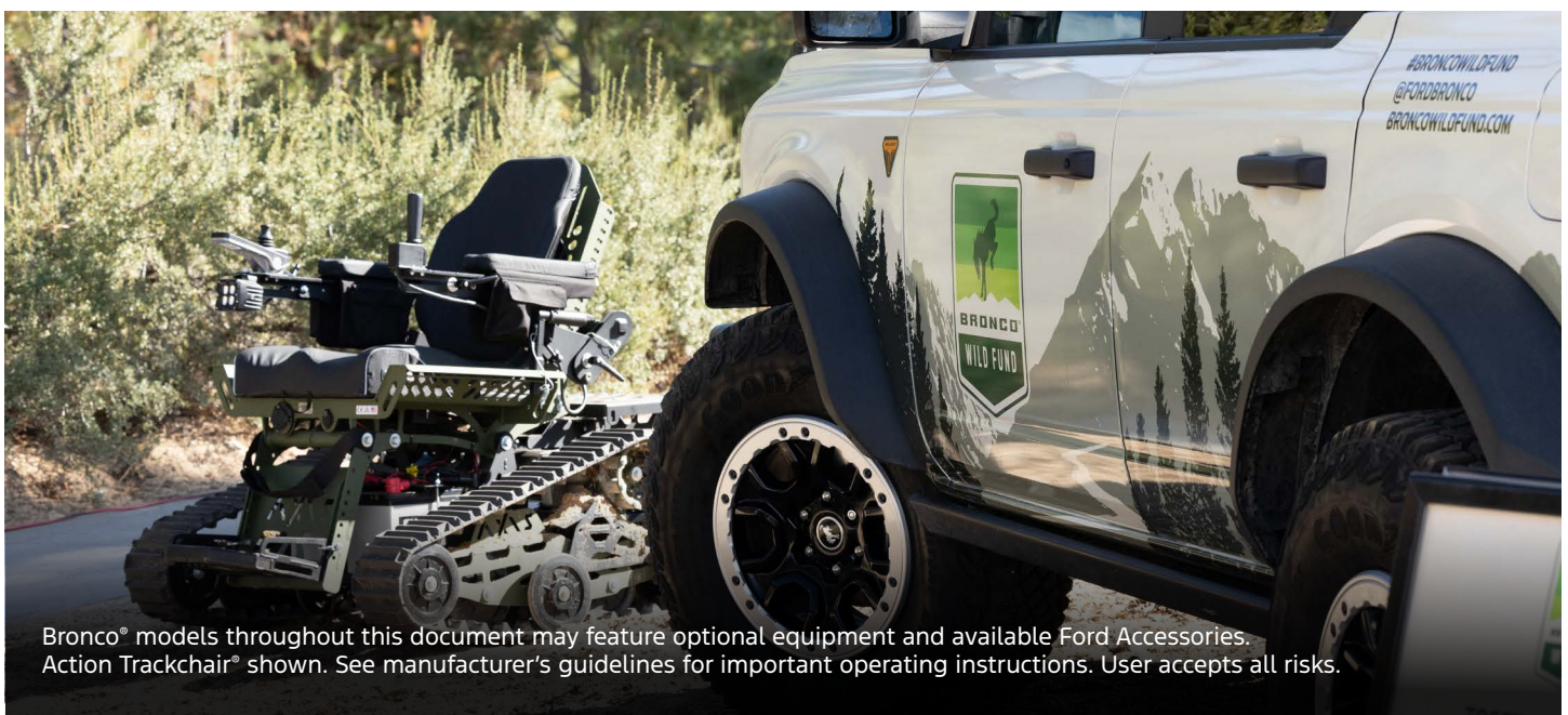
Bronco® models throughout this document may feature optional equipment and available Ford Accessories. Action Trackchair® shown. See manufacturer's guidelines for important operating instructions. User accepts all risks.