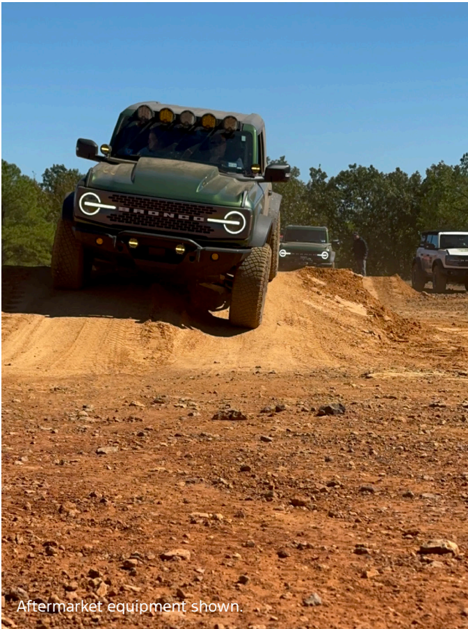
Aftermarket equipment shown.

Texas Ford Dealers worked with the Texas Motorized Trails Commission (TMTC) to support Barnwell Mountain Recreation area. The BWF grant supported creation of a 101 skills area, installation of educational signage, and designation of a “Bronco Trail.” The project was unveiled during a local off-road event attended by many Bronco owners, fostering a sense of community by connecting them to the outdoors responsibly.